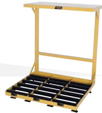
Battery Stand (BS15-3)